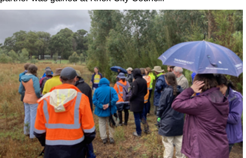
Haining Farm Workshop Participants looking at Climate Plots.

Climate Future Plots Working Group members attended the Greening Australia - Haining Farm Climate Plot Workshop on 'restoration and biodiversity conservation in a changing climate'. Additional knowledge was gained, new connections were made, views for the project were consolidated and an additional project partner was gained at Knox City Council.