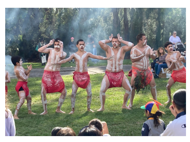
The Koorie Youth Will Shake Spears Dance Group