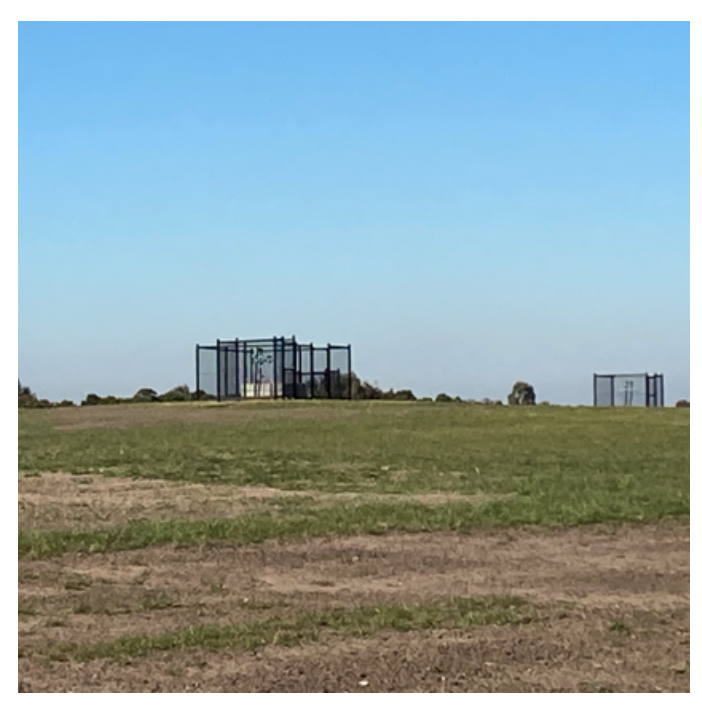
Victory Road Reserve Fenced Gas Extraction Points