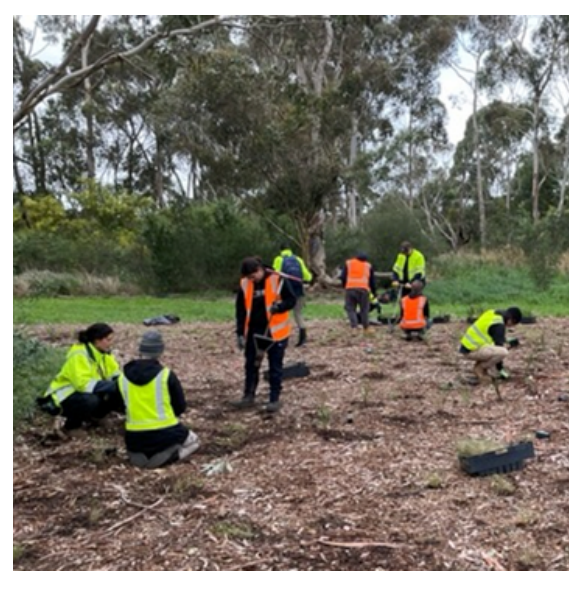
Holmesglen TAFE student tree planting along the Dandenong Creek