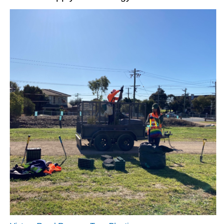
Victory Road Reserve Tree Planting

Kingston landfill site restoration: Revegetation of Elder Street South Reserve in Kingston, and Cleanaway's 7 hectares of in-kind revegetation at the adjacent Victory Road Landfill site are both complete. These 2 new parks will now join the Kingston 'Chain of Parks', providing valuable open space for the local community. Gas generated from the landfill site will be extracted and used to supply local energy.