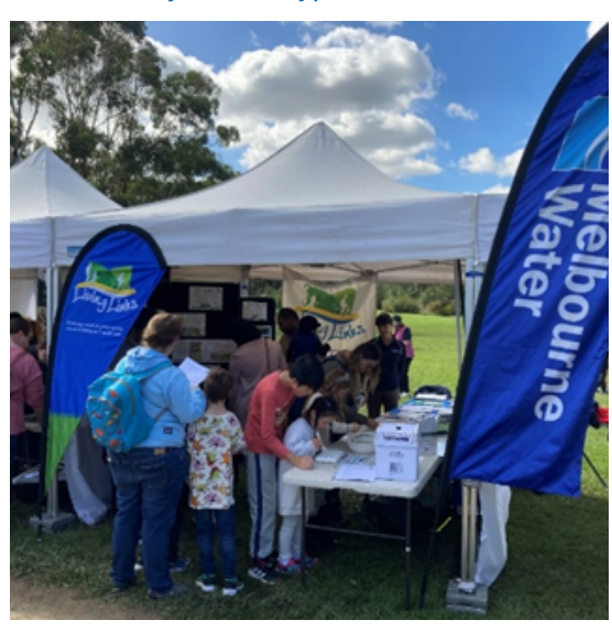
A well attended Living Links tent