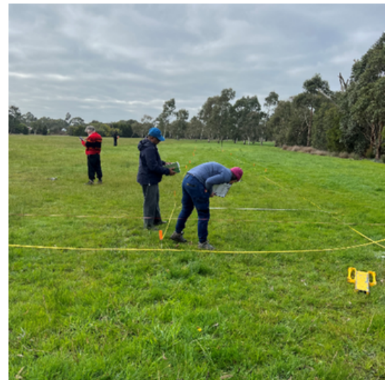
Federation University measuring plots in the City of Greater Dandenong.